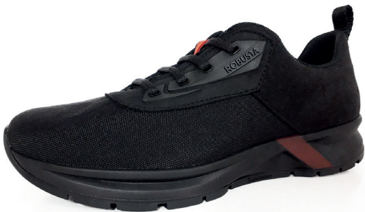
91203 Fusion All Black